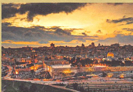
Sunset over Jerusalem