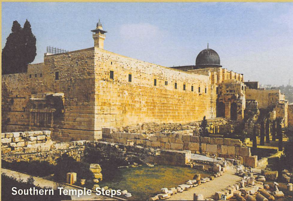
Southern Temple Steps