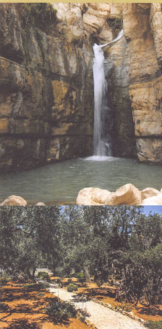
Ein Gedi Falls (top)