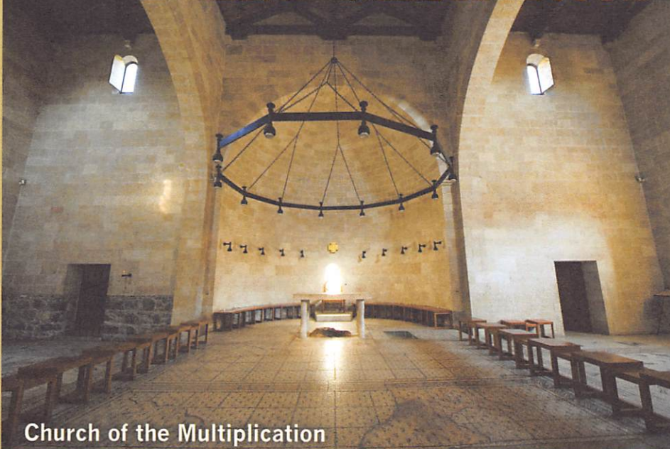
Church of the Multiplication