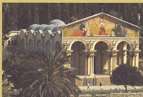
Church of all Nations

Important Note: Tour operator reserves the right to alter any part of this itinerary.